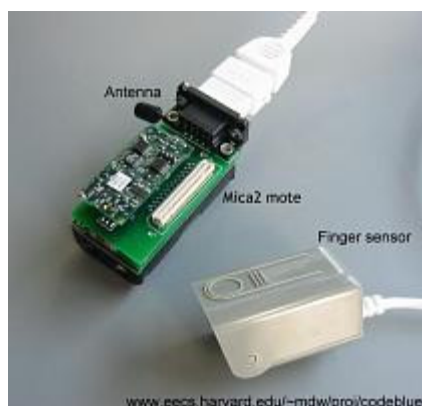
Figure 1: Wireless Pulse Oximeter sensor [ Malan04 ]

The following are images of a few of the devices developed in this project.