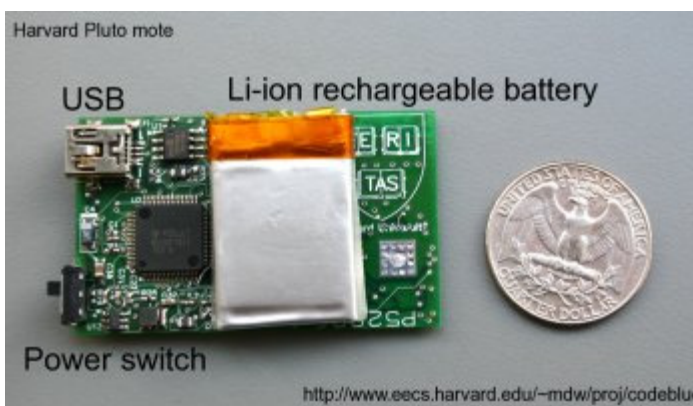
Figure 2: The Harvard "Pluto" mote, designed to be small and wearable [ Malan04 ]